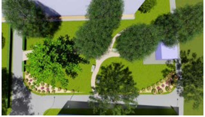
. Fig 12: Design proposal for space behind Administrative building