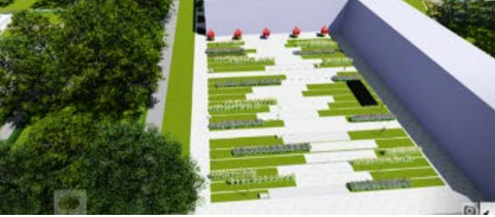
Fig 4. Design proposal for Administration building

Administration building in one of the most important buildings in our study area. In our landscape design, this space is proposed to turn into a frontage of our campus that is done by using different types and colors of shrubs and herbs which will contribute reducing temperature and permeable pavement to reduce surface runoff. Its main function is to create frontage and give an identity and increase aesthetic view. Plants those can be used here Cosmos, Rongon, Dopati, Rokto kanchon and Daisy flower.