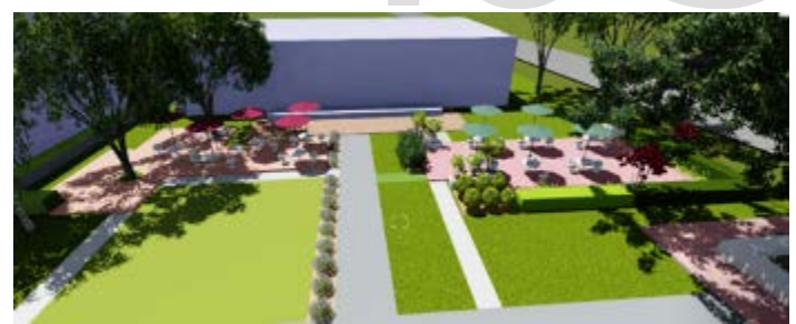
Fig 11: Design proposal for Cafeteria Front

The space that exists between Transportation & Public Health Lab and Fluid and Survey Lab and the space that exists behind the Administration building is developed by providing a food court, benches, and colorful ornamental plants so that users can feel comfortable socializing or enjoying the outdoor environment. Seasonal plant like Krishnochura, evergreen plant like Kaminy, Tecoma and Carpet grass can be used. Through all over the design, the use of impermeable hard surface was minimized.