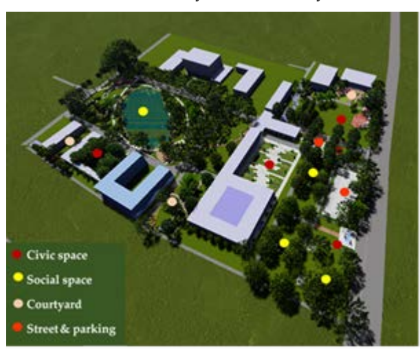
Fig 2. Layout (Administrative portion) Fig 3. Layout (Residential portion)

The vision for the proposed landscaping project in the study area was basically to provide an eco-friendly campus framework among various activity areas. To achieve this goal certain environment principles have been adopted such as water conservation, pollution control, tree preservation, wildlife conservation, soil erosion prevention, reduction of heat island, minimize resource consumption, etc. The characteristics of basic landscape principles have been attempted to obtain over all the design proposal. Proper management of waste and security have also been ensured in the design proposal. To define various functional activity areas the study area has been