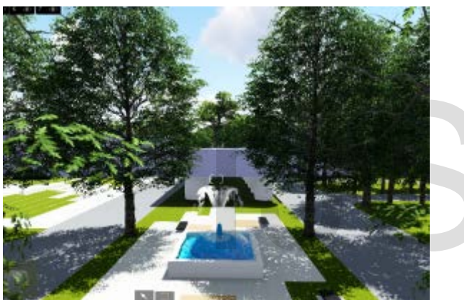
Fig 19: Design proposal for Main entrance

In residential portion, two roads got more importance for designing. The way to L.H. is one which is shaded with large Mahogany trees. At 5ft distance from the road, the study team proposed one row of Hedge along the two side of the road and China rose is proposed to be planted in between two Mahogany trees along both of the road sides. The shrub Hedge and China rose with red colored flower are proposed because they can grow up in shady areas and this portion of the site is shady because of the giant Mahogany trees. Carpet grass is also used as ground cover. The height of the hedge is 2.5ft-3ft and the row is mainly used for security which will control the free movement of outside visitors