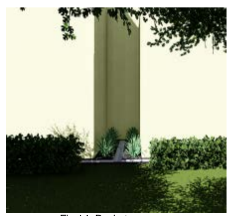
Fig 14: Pocket space