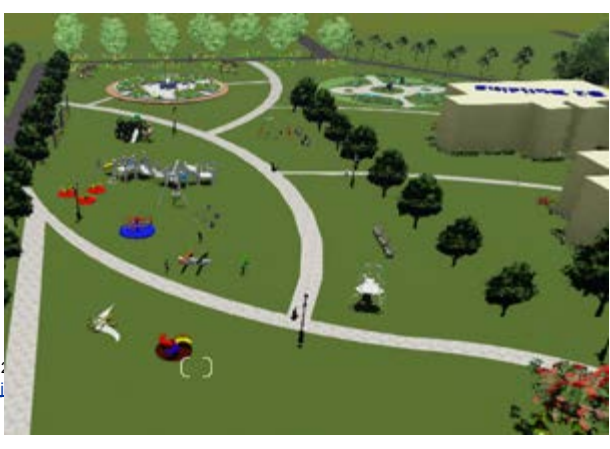
IJSER © 2 http://www.ij

There is a children's playground equipped with many playing equipment such as slippers, balancing, marry-go-round, crawl-tube, moving chairs, cradles. There is also provision of wood made sitting bench especially for the parents to look after their children's. A badminton court is proposed adjacent to the bachelor quarter. Cardia sebestina tree has been proposed each corner of the zigzag seating with a circle of Balsam (red) herb to break the monotony and to extricate the playground from the b1 backyard garden. No existing large trees have been eliminated. There is gravel made cycling way which connects the entire playground, seating, b1 building backyard and b2 building front yard gardens, fountain, buildings, and also with the roads. The entire playground is covered with ground cover, Carpet grass. There is also provision of lighting for ensuring security at night