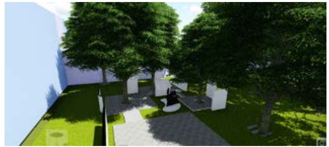
Fig 7: Design proposal for space between Civil building & Fluid and Survey the space is kept open and Lab the other side can be used for the exhibition where the important and significant works of the stu-

The space that exit between Civil building & Fluid and Survey Lab is used for the purpose of surveying lab. For this one side of