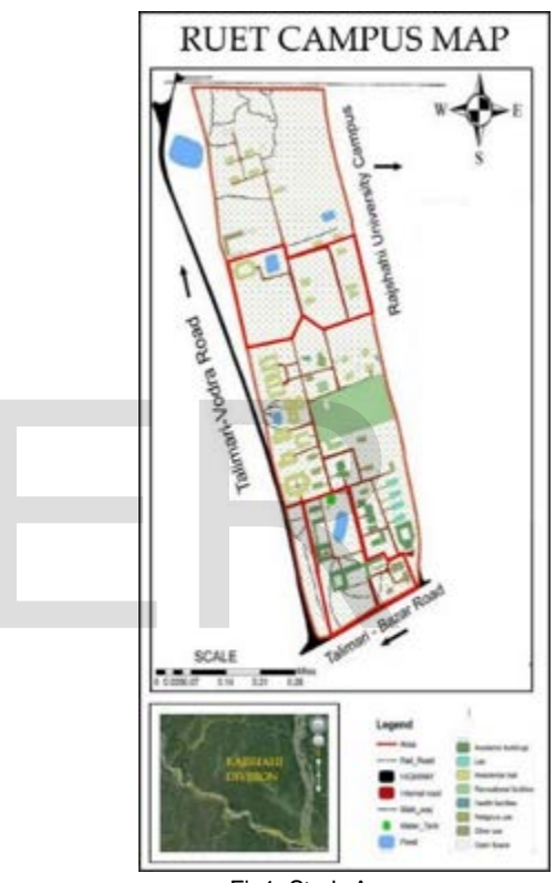
Fig1. Study Area

the principles & guidelines described in the following design ideology section. Some of the conventional principles have been reformulated to meet the location criteria. Eco-friendly design guidelines have been taken into special consideration in the design process. A 2-D sketch of conceptual framework has been designed following the comprehensive set of principles. It was modified several times after conducting a second site inventory and analysis. A final design proposal has been prepared and projected into a 3-D model form afterward. Finally, to ensure proper and efficient management of the project, a detailed report has been submitted as the documentation of the whole procedure.