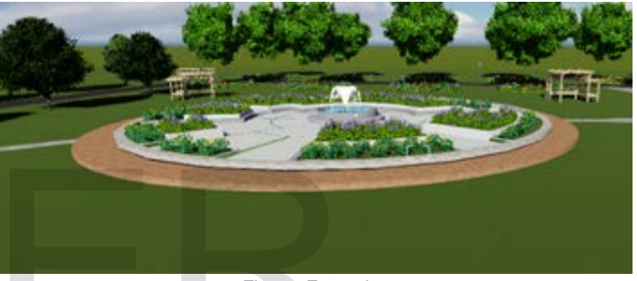
Fig 17: Fountain

Near to the building front yard and play lot a beautifully designed circular shape fountain has been proposed. It is slightly elevated from the ground that the outer circle of the fountain can be used as sitting wall. Thus the users will be able to enjoy the scenery of the area from each angle. Wedelia trilobata and Balsam (purple) are used considering the scale factor to create a harmony, which will improve and enrich the current ecology. The study team proposed blue color lights and two shaded seating to enhance activity spaces both at day and night.