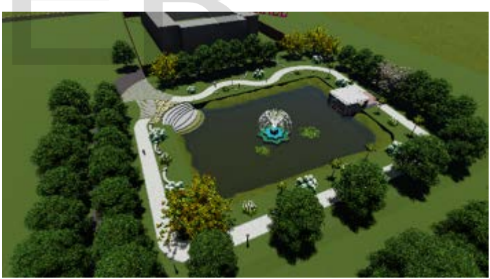
Fig 13: Pond side landscaping

As the pond is adjacent to Desh Ratna Sheikh Hasina Hall, the only Ladies Hall of RUET, it has the potentiality to be a place for recreation. Different types of seating, fountain, kiosk, etc. are provided to invite the students to spend their leisure time here and thus ensures the activity. To design for the female students requires much consideration on the security issue. The roadside portion includes a line of Thuja or Garden croton to restrict the free movement of outside visitors to ensure the safety issue. Different types of lighting are also used for safety at night. There are trash bins to collect the waste and keep the place clean. There are existing large big trees which have a great impact on the ecology; they are kept the same as before to make the design eco-friendly. Different types of shrubs are also used to enrich the ecology of the site as China rose or Jungle flame attracts the birds or other creatures. Bushes are replaced with carpet grass. A permeable walkway is provided to manage storm water and ensure more green. The adjacent wall of ladies hall is also proposed to be a green wall with Ficus pumila plant to ensure green and give the users a feeling of being more close to nature.