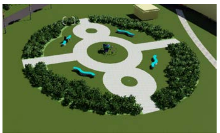
Fig 15: Front yard garden

The B2 building front yard garden is designed from the concept of the meditation garden. So green, blue and purple color is mainly used. Seasonal effect is also taken under consideration. Cosmos and Botam plants are used in two layers centering the flower vase. The flowering season of cosmos plant is winter where the Botam flower blooms in summer and rainy season; so there will be any of the plants bloomed with the flower of purple color throughout the year. Blue colored concrete made curved seating which gives a balanced look with the curve of the pattern of the garden, ensures the activity. People can sit here in a calm and cool environment and enjoy some time for himself. The Kufiya plant is used because of its small scale growth and the green herb with blue flowers. The walkway is brick made and includes carpet grass at the middle of the bricks. Green color light has been used in the garden to beautify the night view of the site at the same time for the mental freshness of the residents who will sit in the garden.