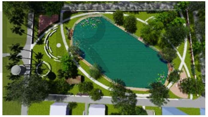
Fig 9: Design proposal for Pond

There is an existing water body which has been turned to be the main focal point of campus. This water body has been renovated to develop a unique identity. There is an existing guard room for security, water treatment plant in this place that is surrounded by shade trees and small plants to create a soothing visual effect. A permeable pathway has been proposed around the pond to provide good circulation. Different types of seating, lightings, and pergolas are provided to influence activities of the users. The existing trees like koroi and Neem are preserved for shade and drought resistance. Kadam and Krishnochura, Rakto Kanchon, Sonalu, Cosmos, Daisy, Thuja, Rongon, Eugenia can also be used in this site as an ornamental and flowering plant to make this place eco-friendly.